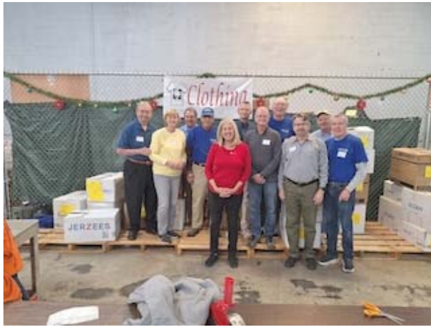
On Saturday, November 1st, a group of

West Richmond club members joined forces with Rotarians from neighboring clubs and volunteers from the Chesterfield Library to fill backpacks with essential items for unhoused individuals in our community. This effort was made possible through a District 7600 Grant in partnership with the Rotary Clubs of Chester, West Richmond, Bon Air, James River (Richmond), Midlothian, as well as the Chesterfield Public Library and the Friends of Chesterfield County Public Library. Service above self — together, we're making a difference one backpack at a time!